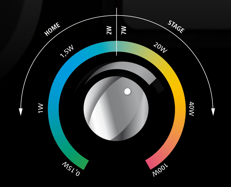
PowerSoak output sections

When PowerSoak 9 is activated, the Level-Control knob controls two sections: Home (0.15 – 2 watts) and Stage (7 – 100 watts) , see graphic.